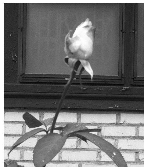
Peace Rose, brought from Allen Park, growing on the south side of the church.

Peace and Blessings—Meredith PS—Check the church out on Facebook.