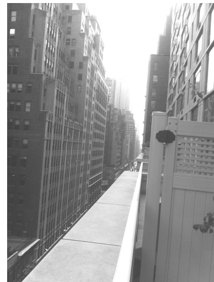
View from our son's apartment on 38th Street looking toward 8th Ave.