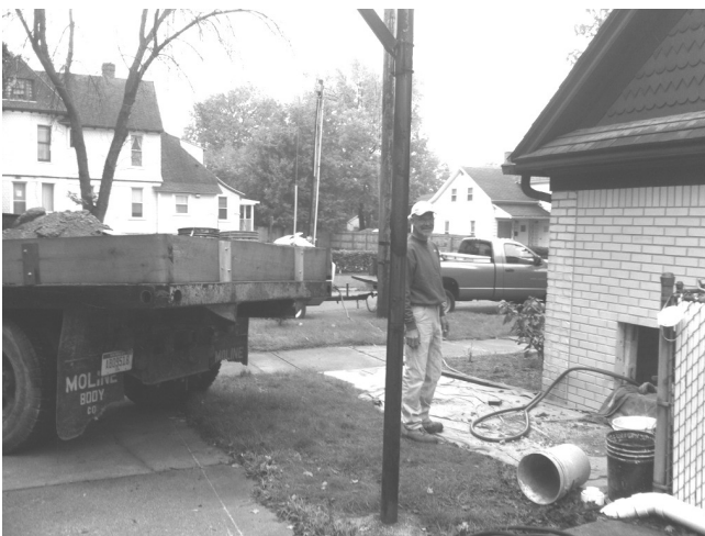
Removing the concrete steps from the old entryway to make way for the new electrical panel.

St. John's Guild will meet on Wed, Oct 5 for Noon-day prayer, lunch, meeting and program.